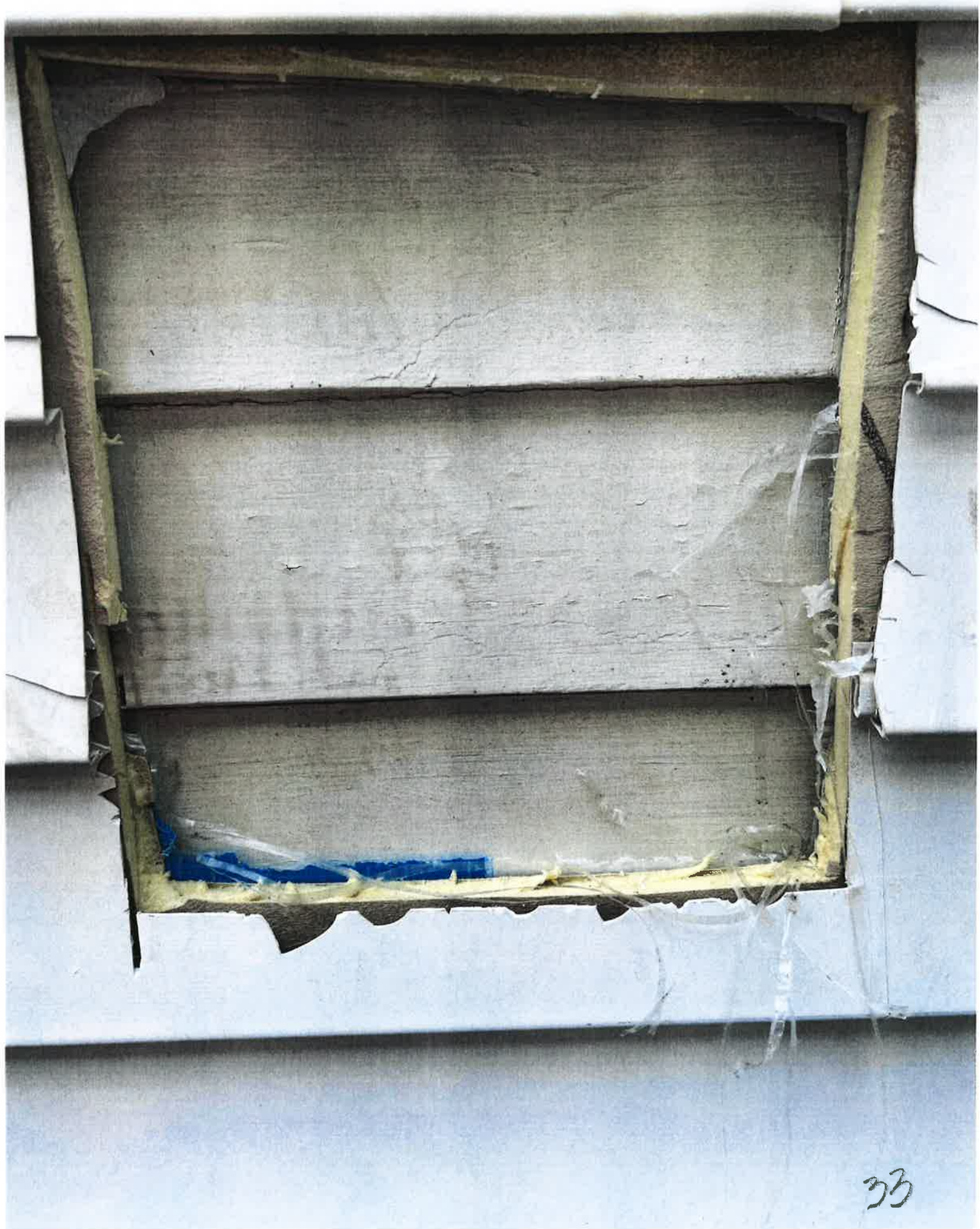
Location 1 - Layer 1, 2, 3 & 4 - Vinyl Siding, Foam Board, Building Paper, & Original Clapboard