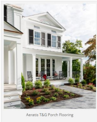
Aeratis T&G Porch Flooring

Aeratis Heritage is a true double-sided tongue and groove porch plank that comes in three pre-finished colors, Battleship Gray, Weathered Wood and Vintage Slate. These colored boards are made with slight color variation along with subtle, random streaking to match the richness and depth of natural wood. Heritage, like all the other Aeratis products, can be painted or stained any color, any time in the future, by following the steps within the Traditions paint instructions.