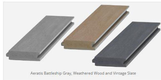
Aeratis Battleship Gray, Weathered Wood and Vintage Slate

Lengths: 12’, 16’, or 20’ Width: 3-1/8” (3.092) Thickness: 7/8”