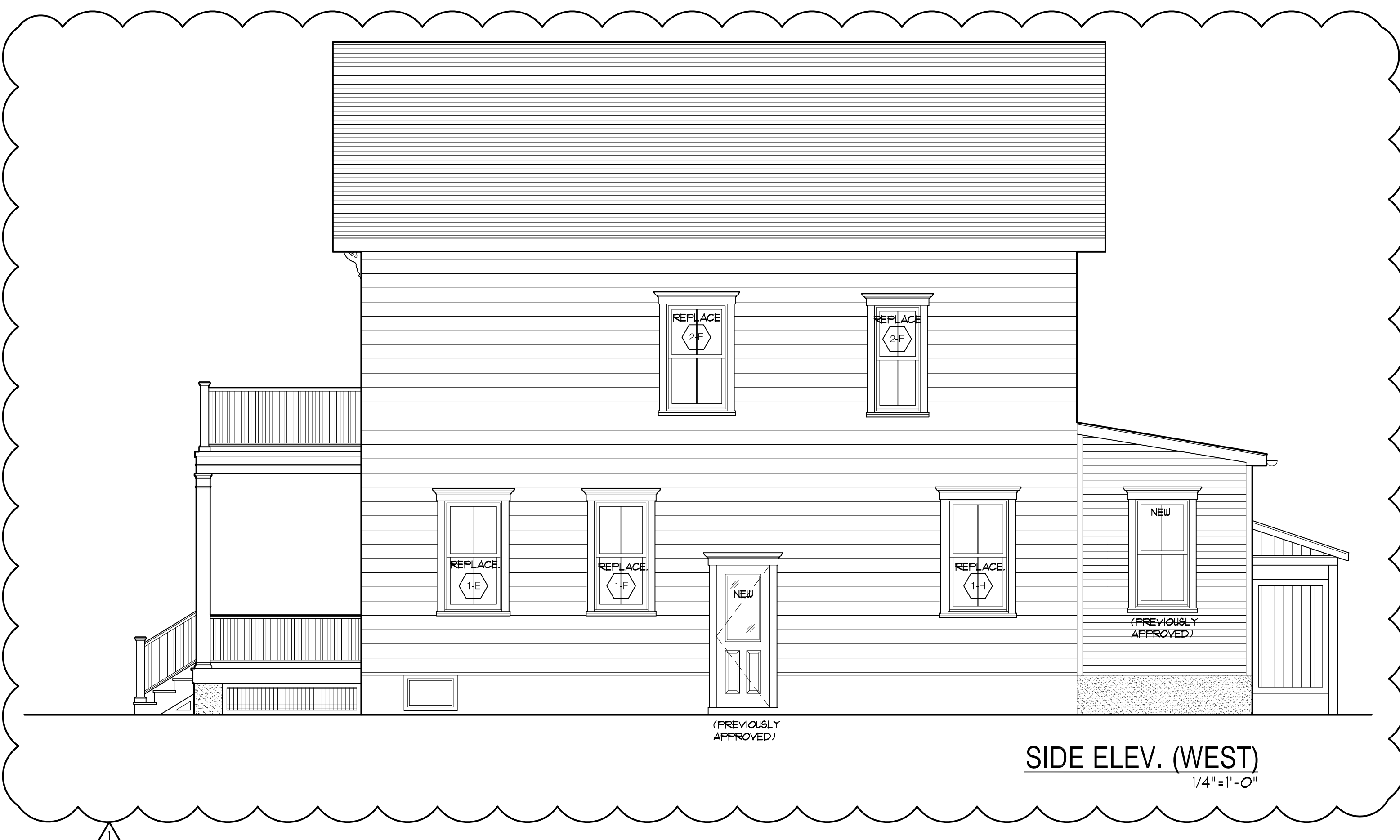
SIDE ELEV. (WEST) 1/4"=1'-0"