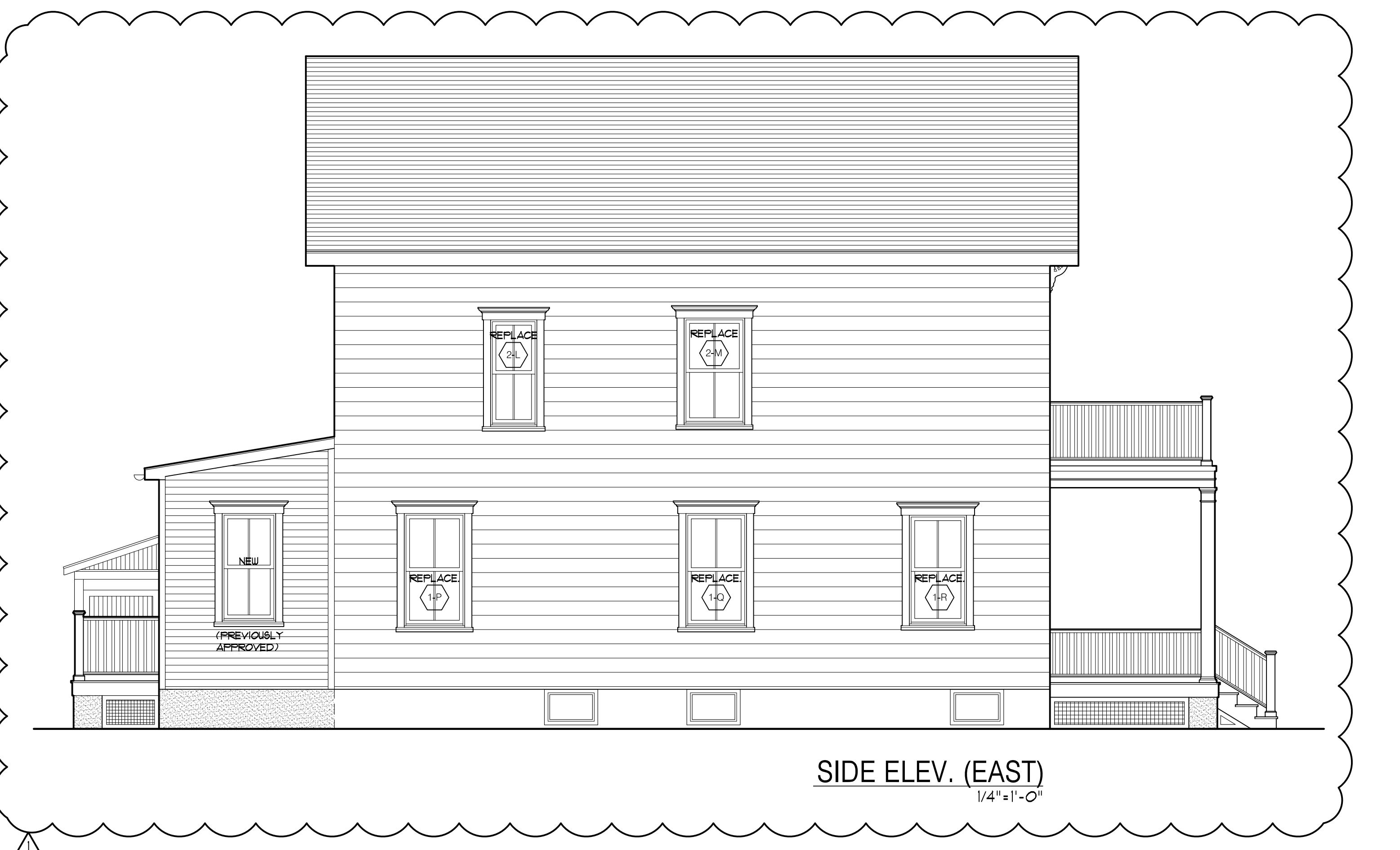
SIDE ELEV. (EAST) 1/4"=1'-0"