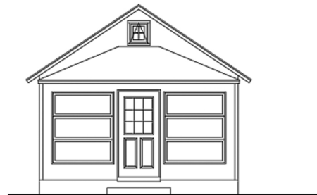
FRONT ELEV. (SOUTH) 1/4"=1'-0"