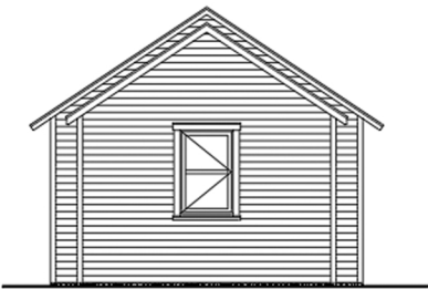
REAR ELEV. (NORTH) 1/4"=1'-0"